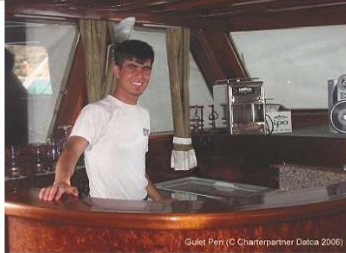
Gulet Peri (C Charterpartner Datca 2006)