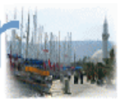
Gulet Peri - Sundeck