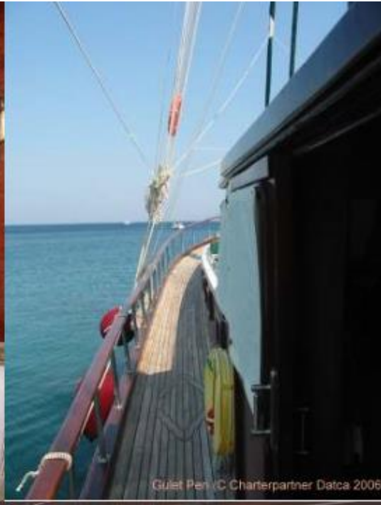
Gulet Peri (C Charterpartner Datca 2006)