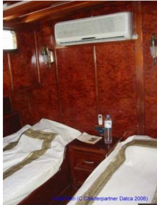
Gulet Peri (C Charterpartner Datca 2006)