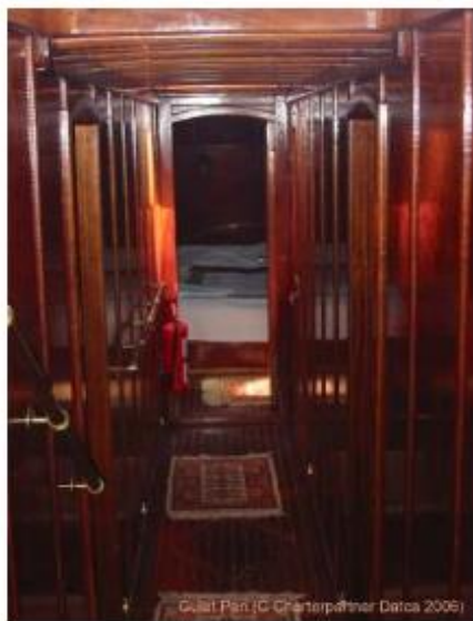
Gulet Peri (C Charterpartner Datca 2006)