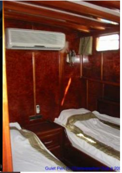
Gulet Peri (C Charterpartner Datca 2006)